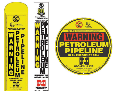
Cenex Pipeline, LLC Pipeline Marker Types

If an emergency situation should arise or you see something suspicious look for pipeline markers in the area. Call 911 first, then the emergency number on the nearest pipeline marker.