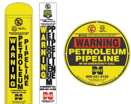
Cenex Pipeline, LLC Pipeline Marker Types

If an emergency situation should arise or you see something suspicious look for pipeline markers in the area. Call 911 first, then the emergency number on the nearest pipeline marker.