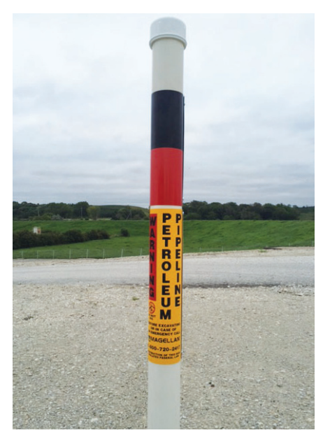
Our pipeline markers can be typically identified by the black and red bands at the top.

Magellan Midstream Partners, L.P., a wholly owned subsidiary of ONEOK, Inc., is principally engaged in the transportation, storage, and distribution of refined products and crude oil. Magellan operates a 9,800 mile refined products pipeline system with 54 connected terminals as well as 25 independent terminals not connected to our pipeline system, two marine terminals (one of which is owned through joint venture) and a 2,200 mile crude oil pipeline system.