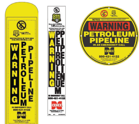
Cenex Pipeline, LLC Pipeline Marker Types

If an emergency situation should arise or you see something suspicious look for pipeline markers in the area. Call 911 first, then the emergency number on the nearest pipeline marker.