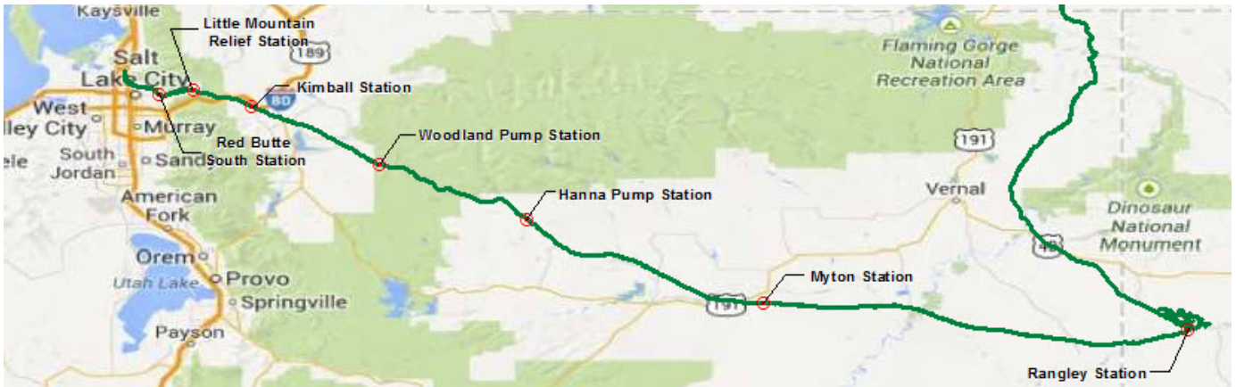
Green line indicates the approximate location of the pipeline. For exact location information, please contact the local office.

Chevron Pipe Line operates in the following counties in Utah: