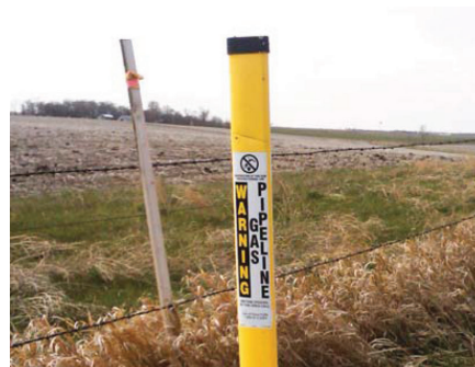
Landfill Gas Pipeline Marker

The City of Sioux Falls is committed to safety and protecting the health of its personnel, neighbors, the general public, and its customers as well as the surrounding environment. Safe practices need to be taught and reinforced throughout the year in an effort to prevent accidents and ensure safe operation. There is no substitute for sound judgment of the situation by the person or persons involved; the safety and well-being of the public, responders, and personnel must always be given prime consideration. Training is conducted by the City to mock certain emergency situations. This will be an aid in emergency preparation and coordination among emergency responders.